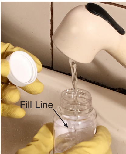
Filling the Sterile Jar