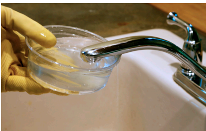
Soaking the tap with the bleach solution