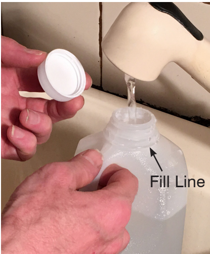
Filling the Big Jug