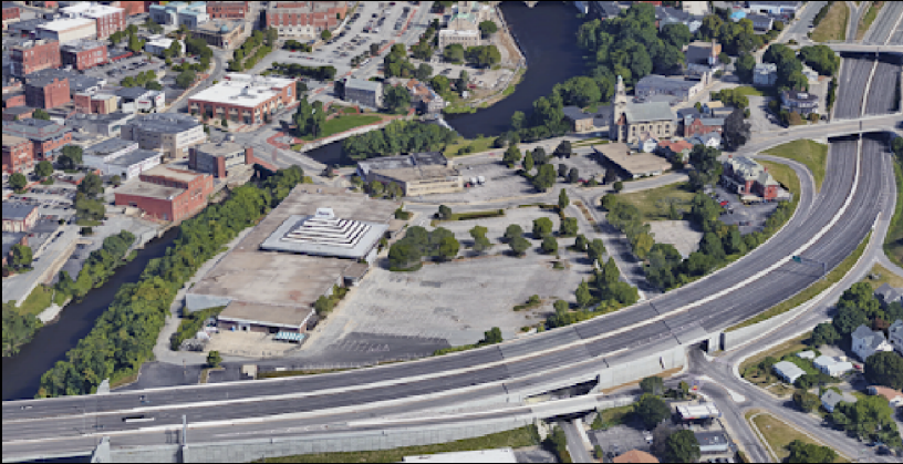
A. | What Store is Here?