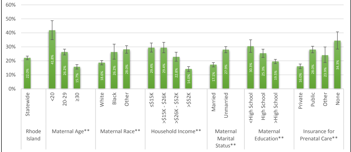
FIGURE 2: POST-PARTUM LARC USE BY DEMOGRAPHIC CHARACTERISTICS, RHODE ISLAND, 2012-2015